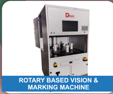
ROTARY BASED VISION & MARKING MACHINE