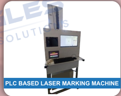
PLC BASED LASER MARKING MACHINE