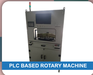
PLC BASED ROTARY MACHINE