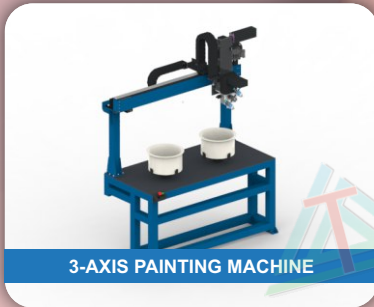
3-AXIS PAINTING MACHINE