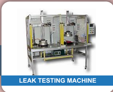
LEAK TESTING MACHINE